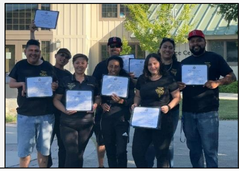
CGA Retreat for formerly incarcerated

CGA now offered to in custody youth at YGC