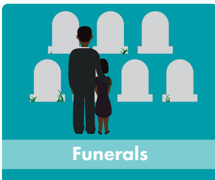
Public religious ceremonies, such as funerals