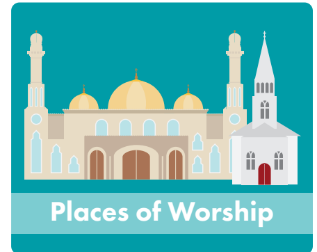
Places of worship or buildings rented for religious services