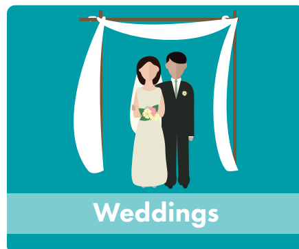
Public religious ceremonies, such as weddings