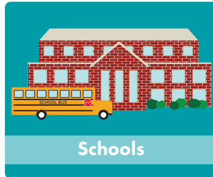
Schools (all levels from preschool through college, also vocational and trade schools)