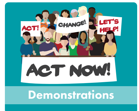
During a march, rally, parade or other public demonstration